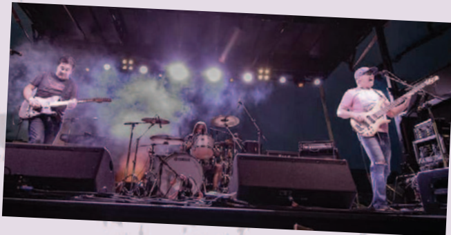
SUNDAY 10:30PM THE YOUNG'UNS