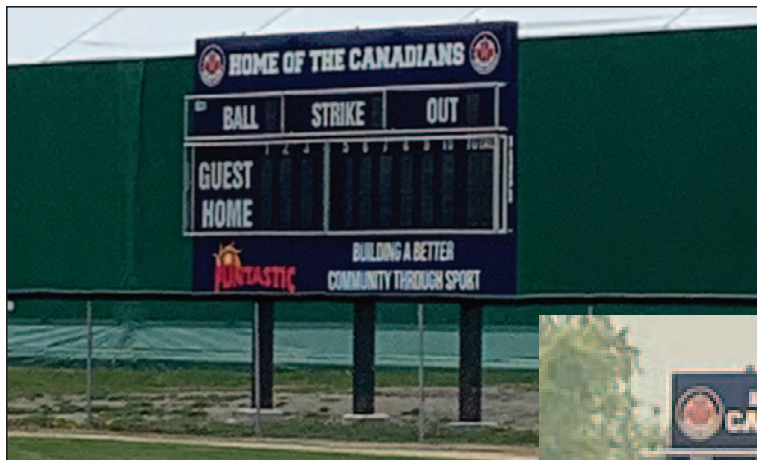
Marshall Field Midget Diamond