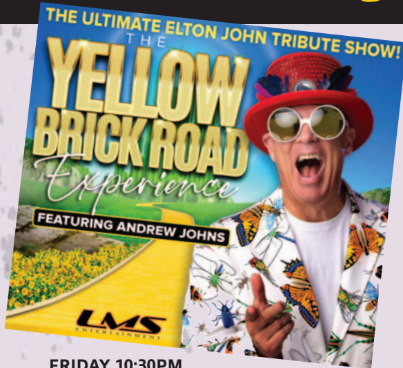
FRIDAY 10:30PM YELLOW BRICK ROAD EXPERIENCE